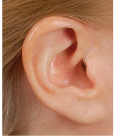
OTE/BTE with small tubing.

Style is one way to distinguish among hearing aids, which range from larger units that fit behind the ear to tiny ones that are almost invisible. You can tell an aid's style by three initials that indicate where they are worn.