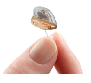
CIC or Completely-In-the-Ear hearing