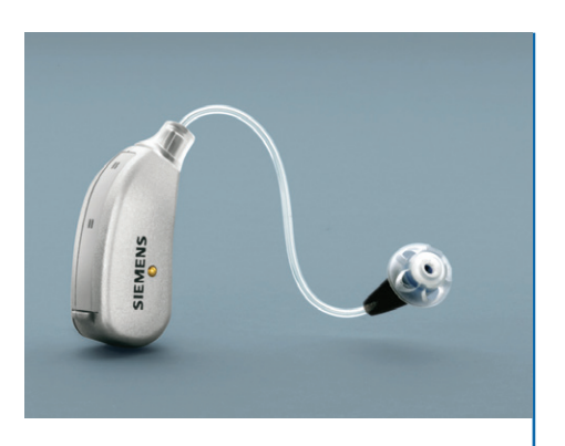
BTE or Behindthe-Ear and Open-Fit Hearing Aid