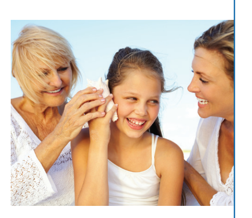
Rediscover the world of clear beautiful sound!

We recommend those brands of hearing aids based on proven quality, digital processing and reliability. In every case, our Hearing Consultants and your local Hearing Professional help in selecting the best hearing aid for your unique hearing loss and personal needs.